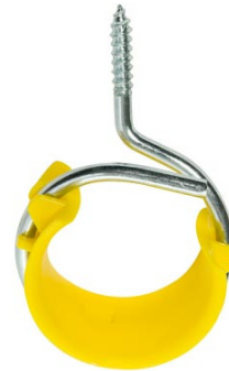
WBR200SDLWS Use with high performance category cable