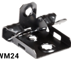
WM24 For 1/8" to 1/4" flange

Provides a mounting base for securely and easily fastening hardware to a steel beam