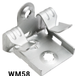
WM58 For 5/16" to 1/2" flange