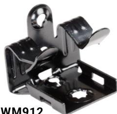
WM912 For 9/16" to 3/4" flange