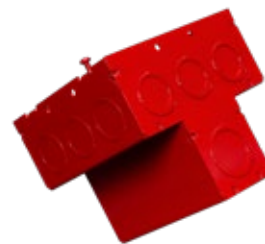
Designed to support fast prefab applications