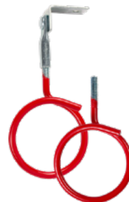
10-plus mounting configurations available

*AC with 90° Angle Clip *PBC with Pressed Beam Clamp, *SSBC with Spring Steel Beam Clamp, *W34 with Multi-Functional Clip