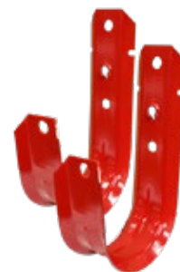
20-plus mounting configurations available

*AC with 90° Angle Clip *ACPBC with Pressed Beam Clamp, *ACSSBC with Spring Steel Beam Clamp, *W with Multi-Functional Clip